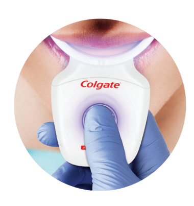
High-energy LED device accelerates whitening