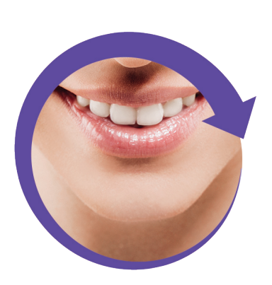
Dramatically whiter teeth in 30 minutes* *Refer to leaflet for full instructions