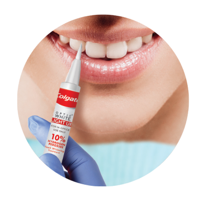
Precision pen applies a quick-dry film only where you need it